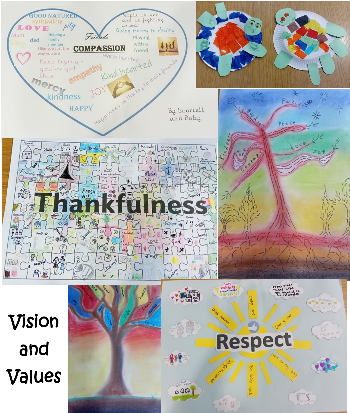
By Scarlett and Ruby

Here are some examples of the wonderful learning from the day: