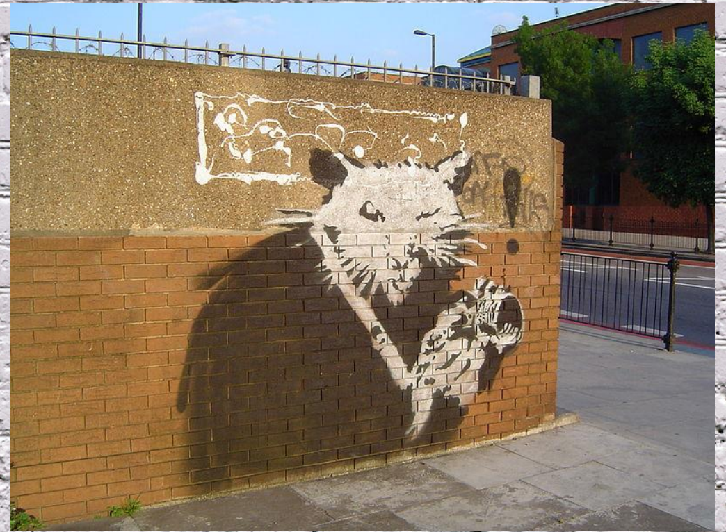
Rat in London The rat is holding a camera. What message do you think Banksy is sending through this painting?