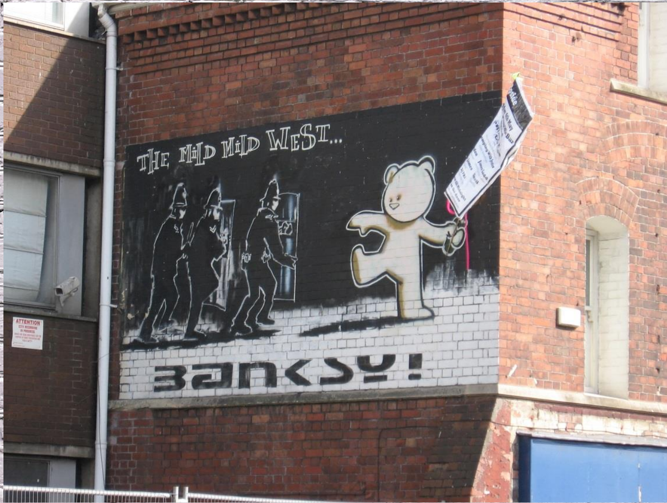
Mild Mild West (1997) was Banksy's first large wall mural. It was painted in Bristol.