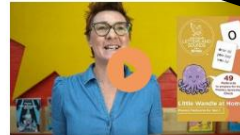
How we teach Phase 5

Here you will find the videos of how different parts of the phonics lesson are taught.