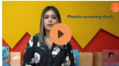
A quick guide to alien words