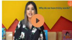
How we teach tricky words