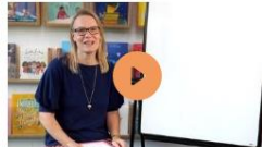
How we teach blending